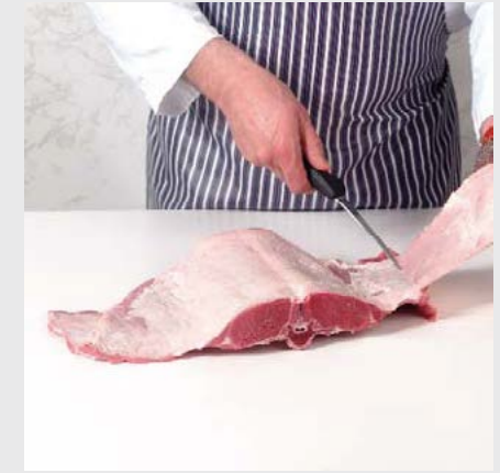
4. Remove the bark muscles.