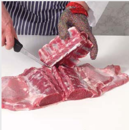
5. Carefully remove the backbone, taking care not to cut through the external fat surface.