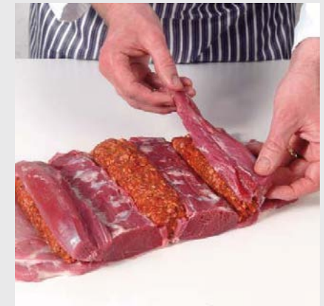
8. Cover the two outer stuffing rolls with the trimmed fillet muscles.