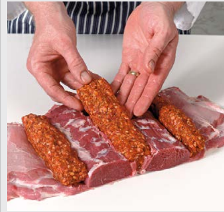
7. Position stuffing rolls in the backbone cavity and along the ventral edge of the eye muscles.