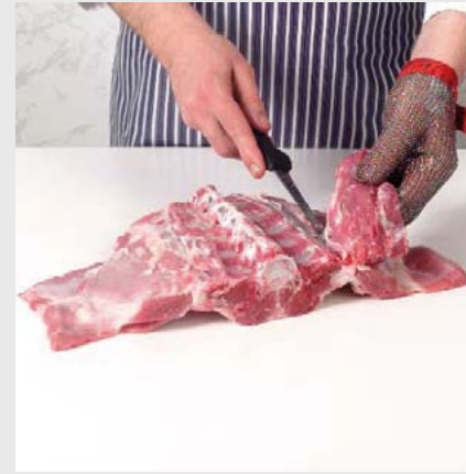
3. Remove both fillet muscles.