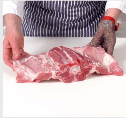
2. Bone-in saddle.