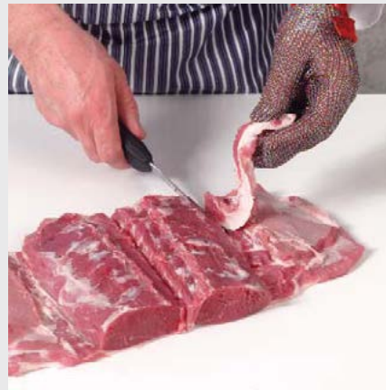
6. Remove fat deposits.